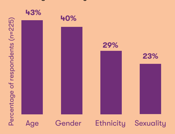
Observed discrimination by protected characteristic

Respondents also highlighted discrimination occurring based on economic background, disability, nationality, religion, pregnancy/maternity, gender identity, and other characteristics. Only 19% said they had not observed any negative comments or abusive behaviour.